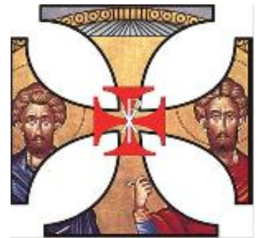
Greek Orthodox Ladies' Philoptochos Society of Holy Trinity Church

If you would like to help us help our community and those in need, please make a donation through online donation, cash or check made out to Philoptochos. You can link your Kroger Card to our Philoptochos too! Every time you shop in Kroger we will benefit!